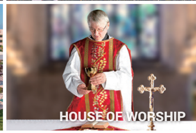
HOUSE OF WORSHIP