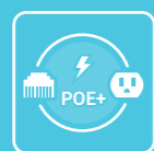
One-Cable Connection with PoE+