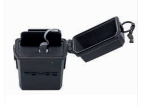
UNITS INCORPORATE INTERNAL BATTERY WITH NO EXTERNAL CABLES