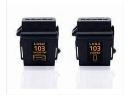
SIMPLE, RUGGEDIZED, TWO-PART PAIRED WIFI BOOSTER SYSTEM