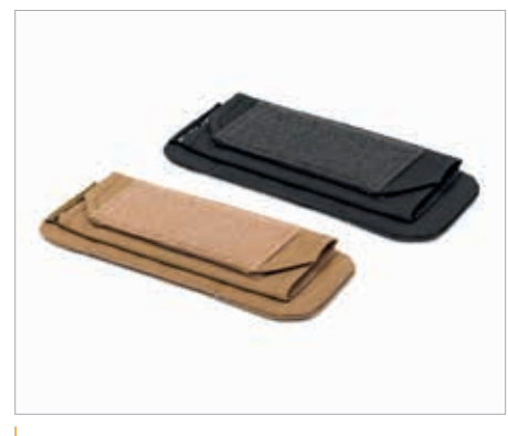
AVAILABLE IN TAN (MH-SMT) AND BLACK (MH-SMBK)