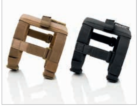
AVAILABLE IN TAN (MH-K9T) AND BLACK (MH-K9BK)