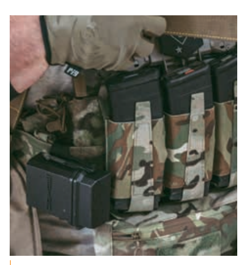
TRANSMITTER UNIT ACCOMPANIES THE OPERATOR & IS MOLLE COMPATIBLE

LASO<sup>™</sup> is the ideal Tactical Video Transmitter for both training and live operations where short-range video streaming is required. The many usecase scenarios include EOD, clearing, K9, and riot control.