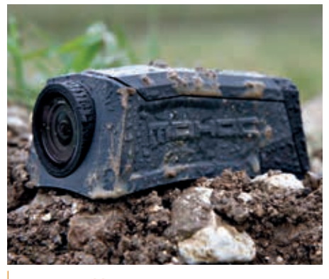
MILITARY RUGGEDIZED WATERPROOF, DROP-PROOF, MISSION READY