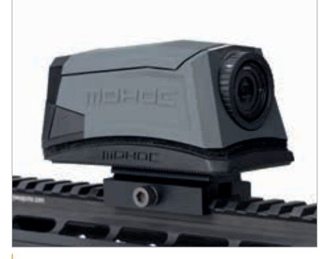
PICATINNY RAIL MOUNT

INCLUDES MULTI-MOUNT, PICATINNY ADAPTOR, ACTION-CAMERA ADAPTOR (MH-MM)