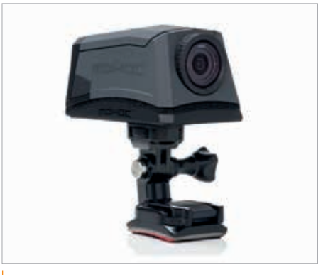
ACTION CAMERA MOUNT