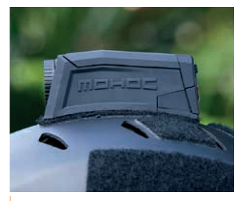
TACTICAL FORM FACTOR HELMET CONTOUR, LOW PROFILE, SNAG-FREE