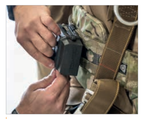
CAN BE CARRIED ON A TACTICAL VEST, K9 HARNESS OR BACKPACK