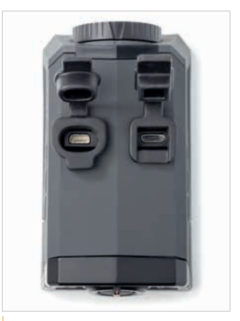
MICRO HDMI & MICRO USB PORTS

The Hardwire Door is easily installed even when wearing gloves, and interchangeable with the standard door when complete waterproofing is required.