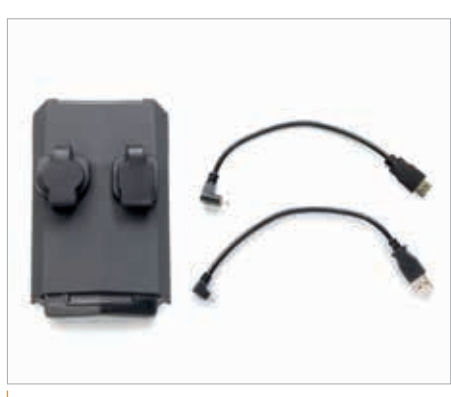
INCLUDES HARDWIRE DOOR & CABLES (MH-HWD)