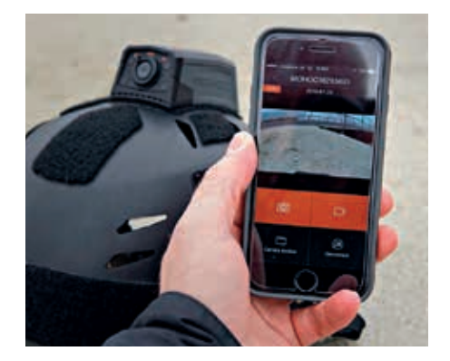
Activate MOHOC's simple, rapidly deployed, Wi-Fi live stream for nearrange video transmission up to 200m/650ft with LASO<sup>™</sup> (see page 9).