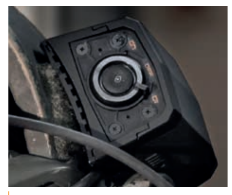
INTUITIVE USE SIMPLE TACTILE OPERATION & VIBRATION ALERTS