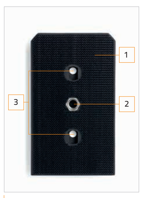
FLAT SURFACE MOUNT (VIEW OF UNDERSIDE)