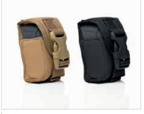
AVAILABLE IN TAN (MH-MCT) AND BLACK (MH-MCBK)